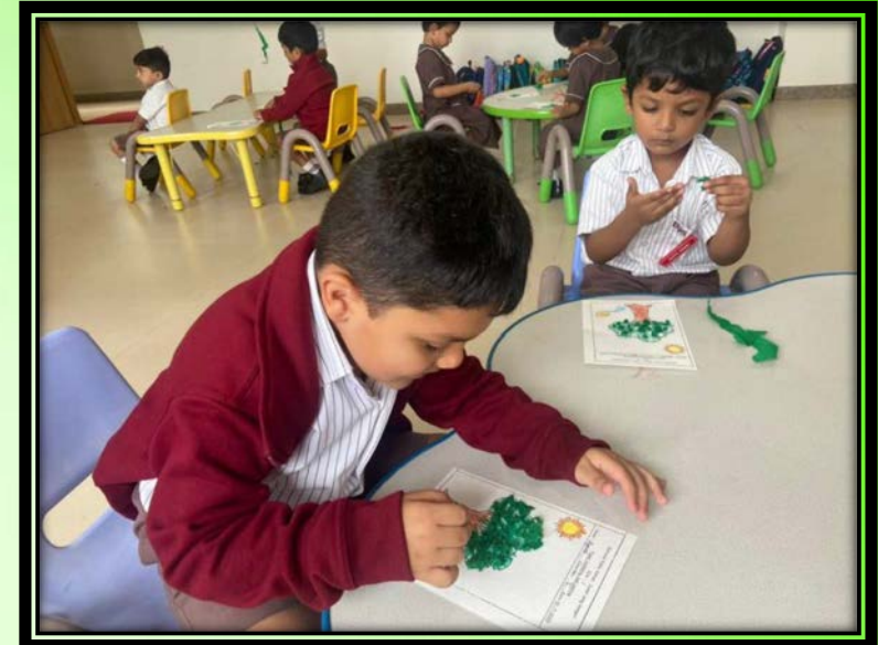
EXPERITENIAL LEARNING OF NURSERY & MONT 1 STUDENTS DURING CO-CURRICULAR ACTIVITY.